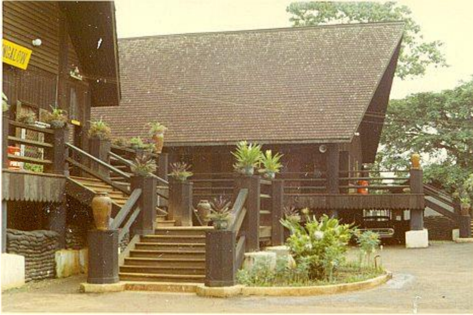
This is "The Grand Bungalow," advisory team (MACV) headquarters at Ban Me Thuot. This was Emperor Bao Dai's hunting lodge, Teddy Roosevelt came here for the tiger hunting. I understand that Bao Dai was the last emperor of Vietnam. 1966. From: http://packrat.manzanitalab.com/Dunton/TGB.html (I have been there. -ed)